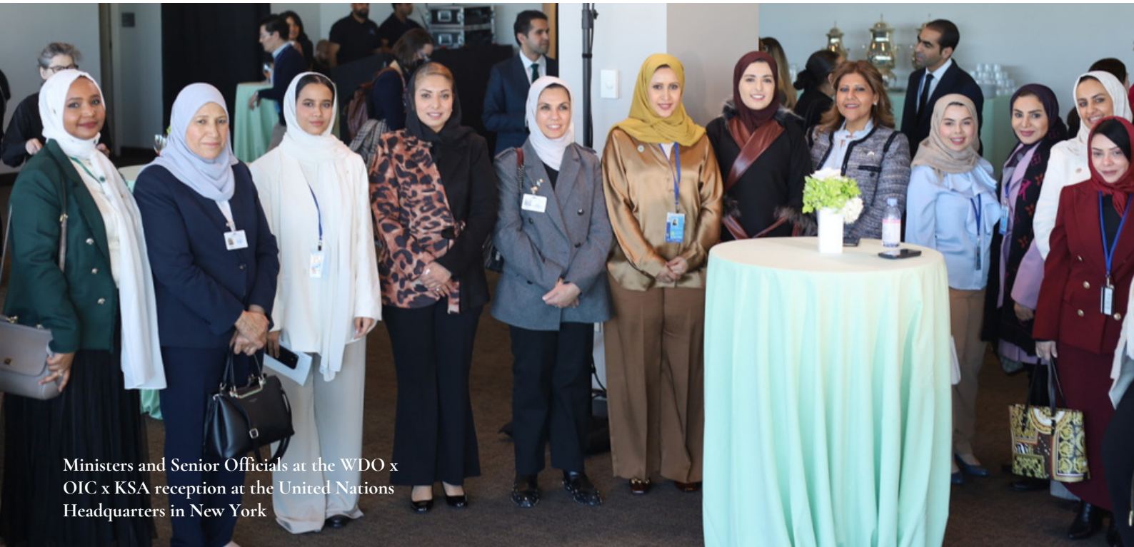
Ministers and Senior Officials at the WDO x OIC x KSA reception at the United Nations Headquarters in New York