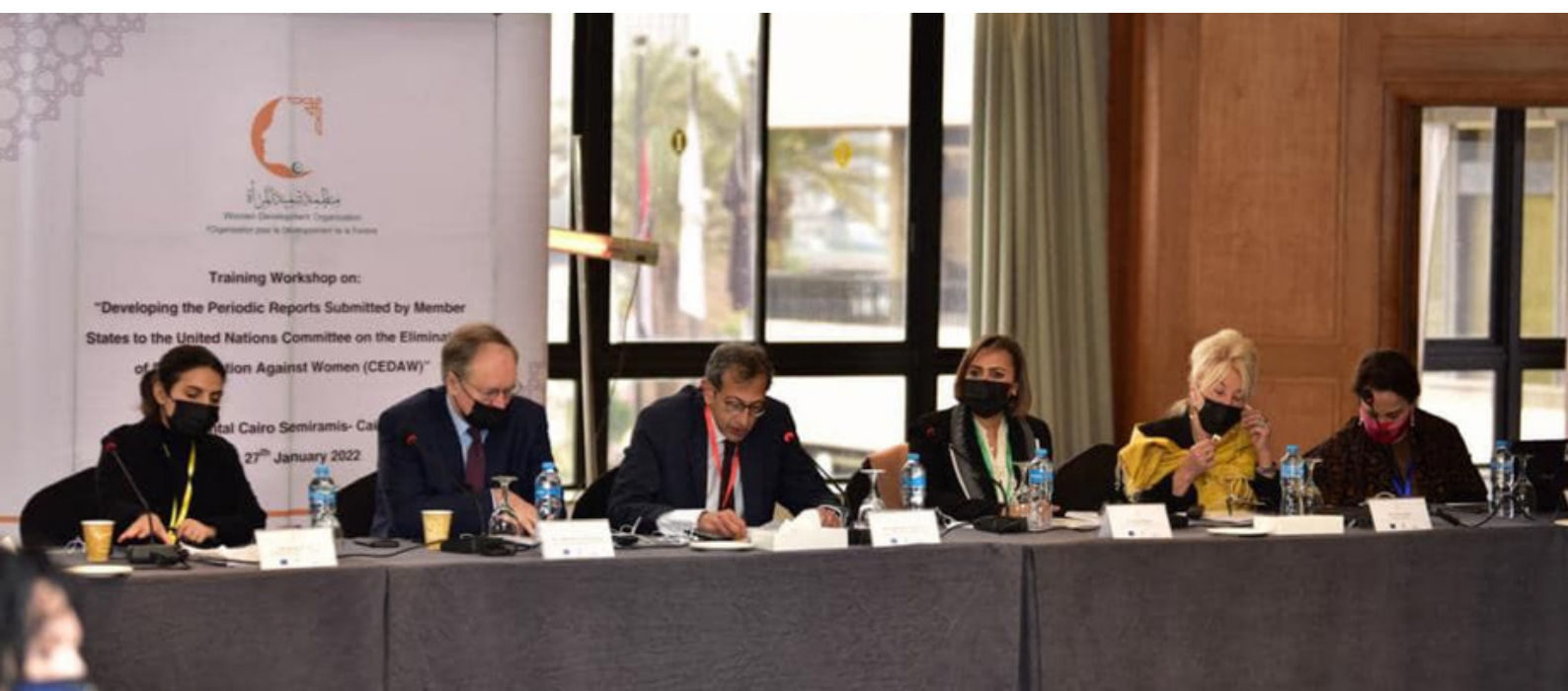
High-level opening session of the CEDAW training workshop in Cairo, Egypt

The European Union Delegation in Egypt and the United Nations Entity for Gender Equality (UN Women) co-organized this successful event, which was facilitated by 5 CEDAW committee experts. Participants from 11 member countries of WDO attended the training workshop.