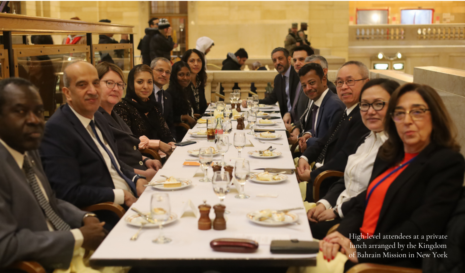
High-level attendees at a private lunch arranged by the Kingdom of Bahrain Mission in New York