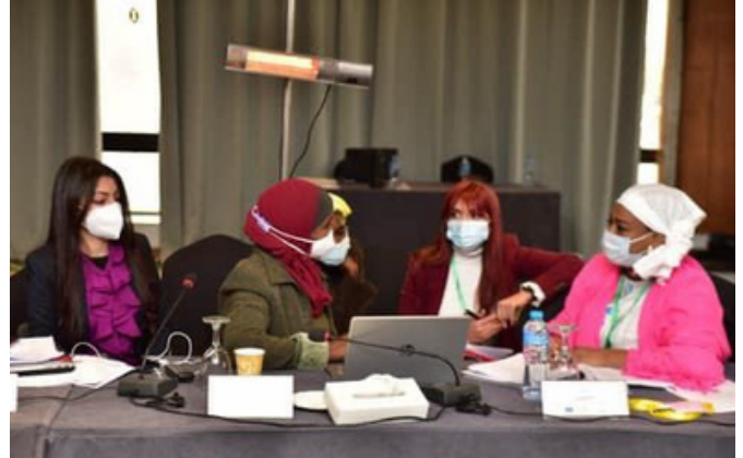
WDO team with participants at CEDAW training workshop in Cairo, Egypt