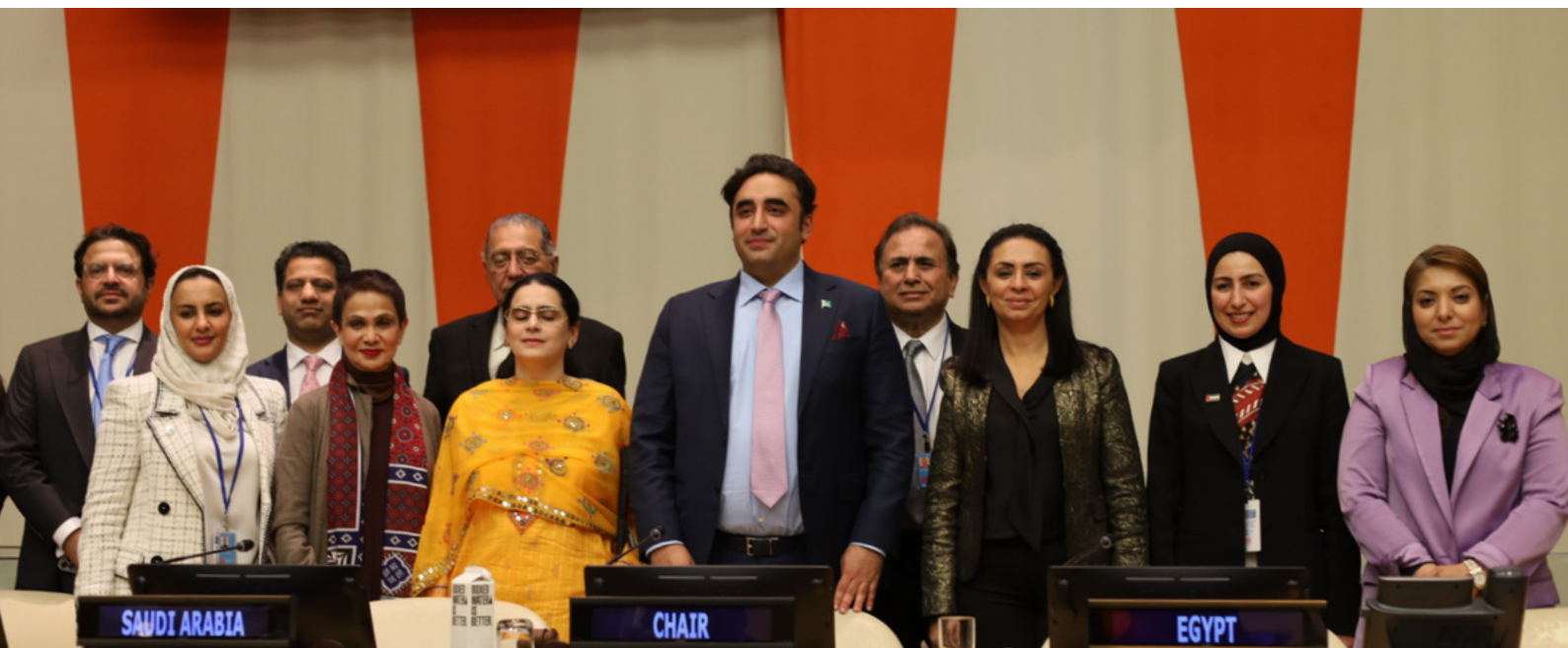
High-level panelists during the Women in Islam side event at CSW67 at the United Nations Headquarters in New York

The session was organized by the Permanent Mission of Pakistan to the United Nations, headed by His Excellency Bilawal Bhutto Zardari, Pakistan's Minister of Foreign Affairs. During the session, WDO showcased its first documentary featuring notable Muslim women throughout history.