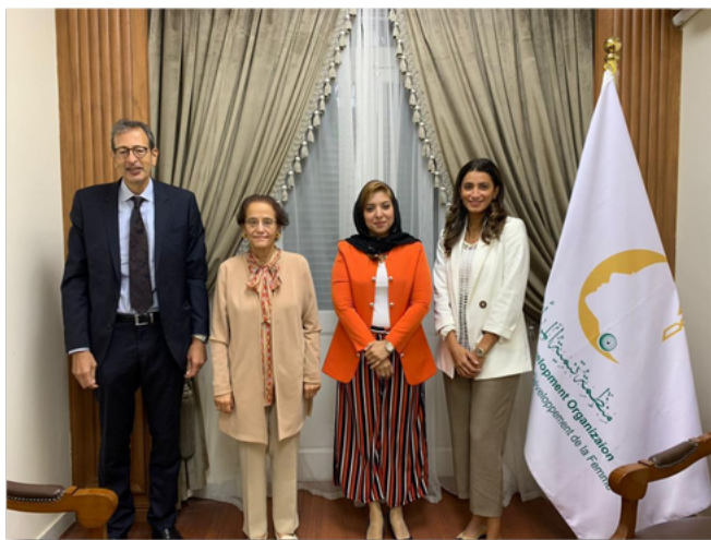
API delegation received at WDO Headquarters in Cairo, Egypt